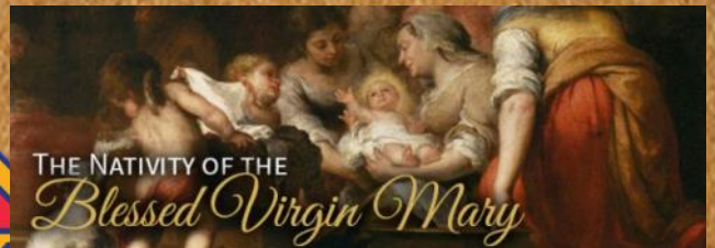
THE NATIVITY OF THE Blessed Virgin Mary